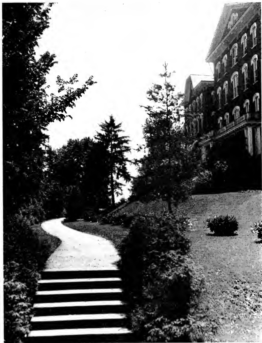
THE EAST WALK