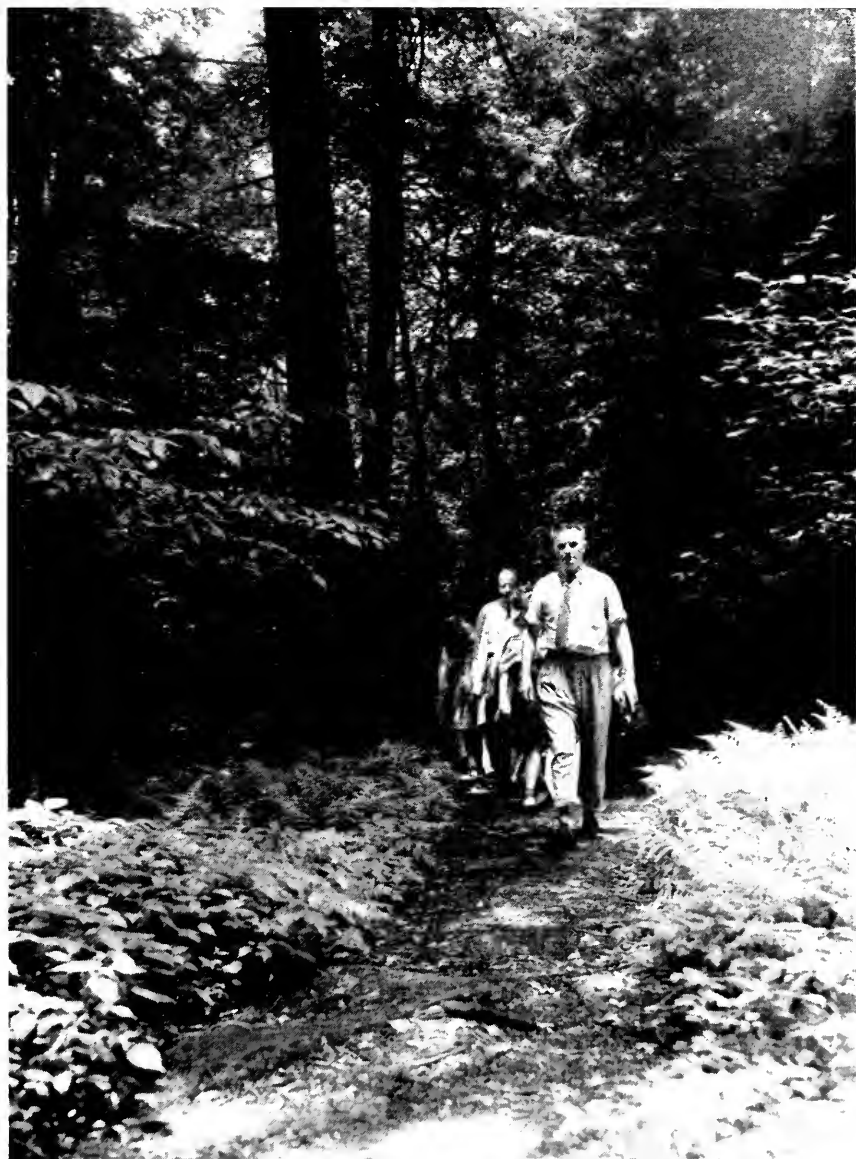
HIKING IN THE WOODS