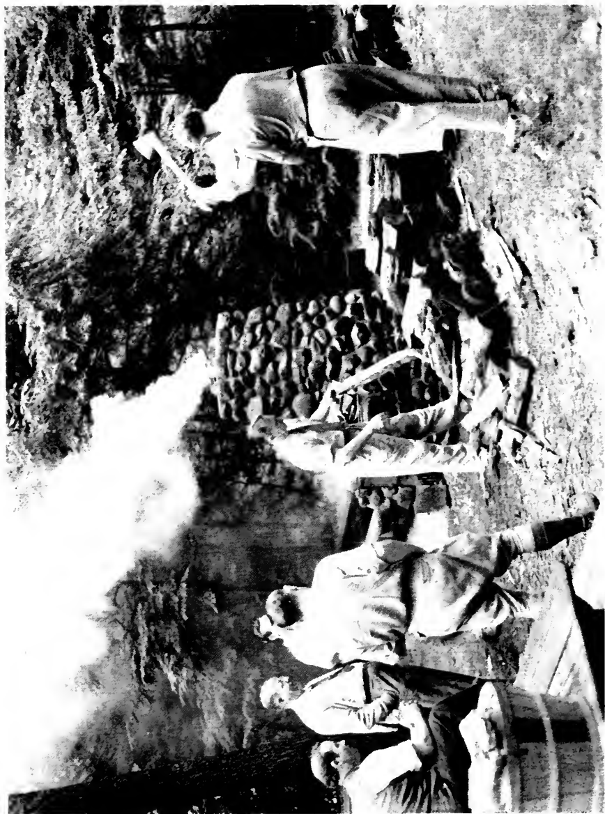
THE STEAKS (?) ARE COOKING