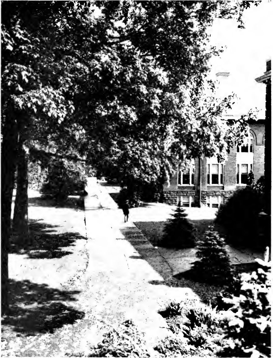
LOOKING DOWN NORTH WALK